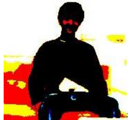
Figure 8:Fused image

The discrete wavelet transform DWT is a spatial frequency decomposition that provides a flexible multi resolution analysis of an image. In wavelet transformation due to sampling, the image size is halved in both spatial directions at each level of decomposition process thus leading to a multi-resolution signal representation. The advantages of image fusion over visual comparison of multi-modality are: (a) the fusion technique is useful to correct for variability in orientation, position and dimension; (b) it allows precise anatomic/physiologic correlation; and (c) it permits regional quantisation. Many image processing like denoising, contrast enhancement, edge detection, segmentation, texture analysis and compression can be easily and successfully performed in the wavelet domain. Wavelet techniques thus provide a powerful set of tools for image enhancement and analysis together with a common framework for various fusion tasks. Applying fusion technique image sharpness and contrast enhanced. Then this fused image converted into gray scale image is shown in figure 9 .