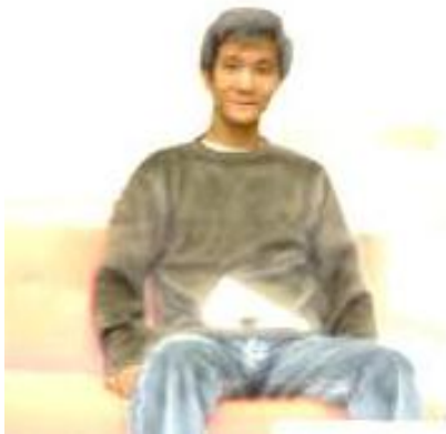
Figure 6:Combined1 image

IR image lies the intensity between 0 to 255 intensity thus complement means subtracting all matrix component from 255 and we get complemented form or reverse form of the IR image. Then add visual image and complemented IR image which is shown in figure 6 .