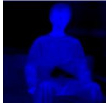
Figure 7:HSV image

In this steps fusion is not possible due to dimension mismatch. We do these steps because in this step difference between hiding details and man are recognizable. Then we convert IR image into HSV colour model and it is shown in figure7 because components of IR image are all correlated with the amount of light hitting the object, and therefore with each other, image descriptions in terms of those components make object discrimination difficult. Descriptions in terms of hue/lightness/saturation are often more relevant. After converting HSV model the image is now three components. Now we can use fusion technique because two images have the same dimension with same size. Then we use DWT fusion technique between HSV color image and combined image is shown in figure 8 .