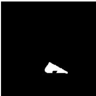
Figure 10:Weapon in binary image

This steps is required for the next step in which we use a binarization technique. There are several binarization techniques among them Otsu, Bernsen, savala ,th-mean, niblack and iterative partitioning as a framework method are showing good result for this type of image. Here we use Otsu method which is a globalThresholding method i.ethreshold value are calculated locally and get the result, no extra threshold value is added here. Extract this weaponportion by calculating all connected area component then remove too small component according to the area values. This only weapon portion binary image is shown in figure 10 .