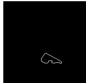
Figure 12:Contour of the Weapon image

Contour detection is used to detect edges of weapon from the weapon binary image.Edge detection refers to the process of identifying and locating sharp discontinuities in an image. The discontinuities are abrupt changes in pixel intensity which characterize boundaries of objects in a scene. There is an extremely large number of edge detection operators available, each designed to be sensitive to certain types of edges. Here we use canny edge detection techniques.The Canny edge detection algorithm is known to many as the optimal edge detector.Canny's edge detection algorithm is computationally more expensive compared to Sobel, Prewitt and Robert's operator. However, the Canny's edge detection algorithm performs better than all these operators under almost all scenarios. This contour detection of concealed weapon is shown in figure 12 .