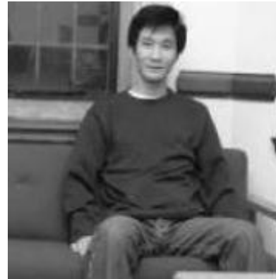
Figure 3: Gray image

Though this part of the gray scale conversion are not take in to consideration in our algorithms to find out concealed weapon. This part is to visual comparison between one dimension IR image and gray image.