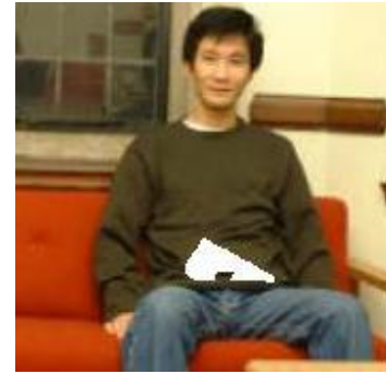
Figure 11:Weaponin visual image

Let us we want to show the weapon in the actual RGB visual image. The weapon binary images are stored into three different components because we want multiply it with three dimensional RGB image. Multiply individual element to element between two matrixes. In this step we detect weapon with visual RGB image is shown in figure 11 .