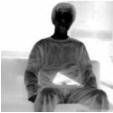
Figure 5:Complemented IR

IR image lies the intensity between 0 to 255 intensity thus complement means subtracting all matrix component from 255 and we get complemented form or reverse form of the IR image. Then add visual image and complemented IR image which is shown in figure 6 .