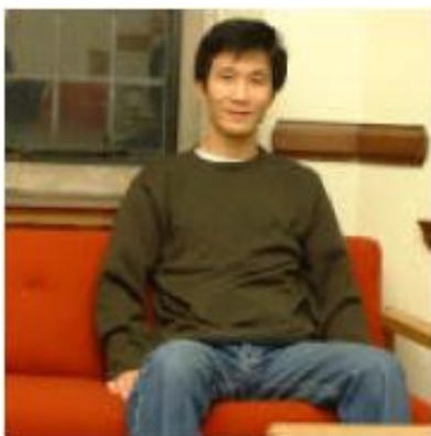
Figure 1: RGB image

The weapons detection algorithm consists of several steps which will be explained in detail in the following. Take two images in the same pose visual RGB image and IR image which are shown in figure 1 and figure 2 . Resize these two types of image because image fusion and addition are not able to perform if the sizes are not same.