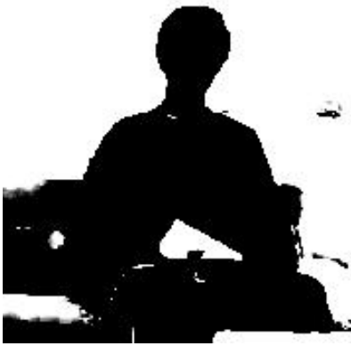
Figure 9:Fused gray image

This steps is required for the next step in which we use a binarization technique. There are several binarization techniques among them Otsu, Bernsen, savala ,th-mean, niblack and iterative partitioning as a framework method are showing good result for this type of image. Here we use Otsu method which is a globalThresholding method i.ethreshold value are calculated locally and get the result, no extra threshold value is added here. Extract this weaponportion by calculating all connected area component then remove too small component according to the area values. This only weapon portion binary image is shown in figure 10 .