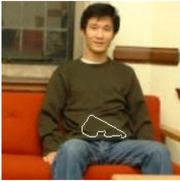
Figure 13: Contour with Visual Image

Then this binarizes contour image are divided into three component and multiply as before and get contour with visual RGB image which is shown in figure 13 where we can see the concealed weapon under person clothes easily.