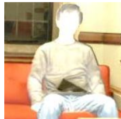
Figure 4: Combined image

Combine basically add visual image and IR image and the result is shown in figure 4 . Actually we want to detect the hiding details from figure 4 but image from figure 4 is hazy, so we do not get enough information from figure 4 .